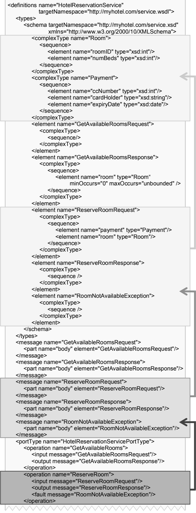
Figure 2. The pieces of the ReserveRoom operation from a hotel reservation service description are highlighted.

The description of an operation in a WSDL document is divided into many pieces. It begins in the portTypes> section where