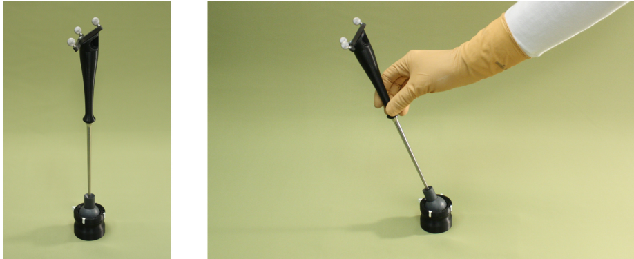
Fig. 1. The input device is activated when a tracked surgical probe is inserted into the base. Force feedback returns the probe to center and permits clicking.

New technology usually has slow acceptance in the operating room, in part due to human factors limitations [4]. A new device can require a substantial training period for both the surgeon and staff.