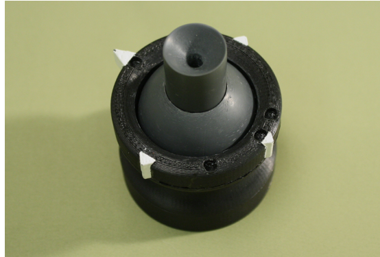
Fig. 2. The base of the joystick device. The probe is inserted into the hole on top of the small cylinder and can be tilted with two degrees of freedom. Pressing the probe down to click causes the small cylinder to move into the ball while still permitting the probe to be tilted.

and reassembled in the operating room prior to the operation. Assembly and disassembly take at most a minute each.