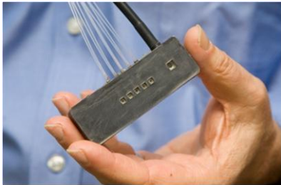
Figure 1. A picture of the right probe. A probe includes a detector (larger square) and four light sources (smaller squares).