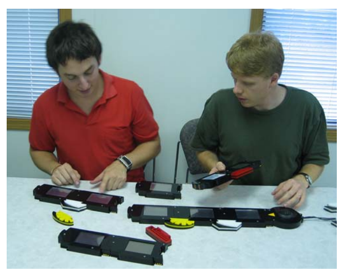
Figure 1. As interaction moves into the real world, users are allowed to engage their full bodies and use their environments to organize information.

With ubiquitous, mobile and sensor technology, computation has moved out of the lab or office and into the greater world. While portability is a major part of this shift, we believe that both the integration of devices within the physical environment and the acquisition of input from the environment, serve as factors contributing to it as well. As interaction takes place within the real-physical world, users are allowed to engage their full bodies in the interaction and use their physical environment to organize information (figure 1). Indeed, research has found evidence of distributed cognition involved with reality-based interaction [17]. Furthermore, interaction in the real world often involves multiple users interacting in parallel with multiple devices.